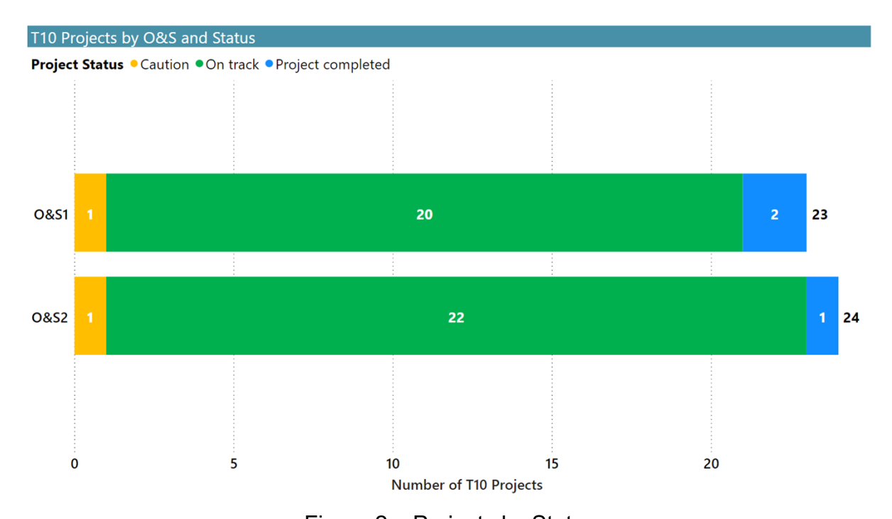
Figure 2 - Projects by Status